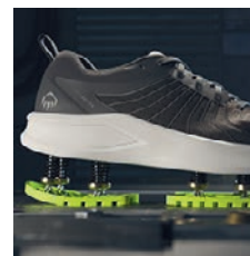
SHOCK ABSORPTION OF WOLVERINE DURASHOCKS