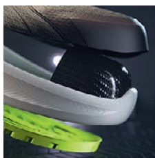
LIGHTWEIGHT PROTECTION OF A CARBONMAX SAFETY TOE