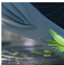
DURASPRING CUSHIONING FOR LONG LASTING MAXIMUM SUPPORT